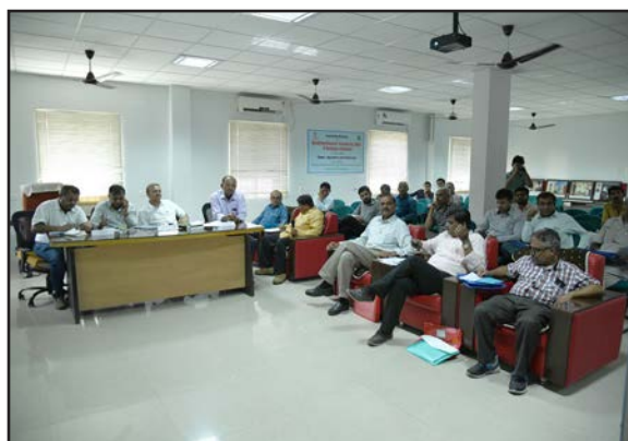
Theme 1 Session at Department of Microbiology & Biofertilizer