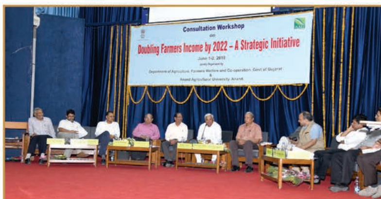
Shri R.C. Faldu, Hon'ble Minister, Agriculture, Rural Development, Fisheries, Animal Husbandry, Transport, Government of Gujarat addressing at Valedictory session