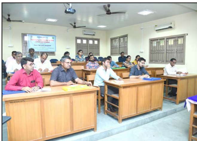
Theme 2 Session at Sardar Smruti Kendra Training Hall - 2