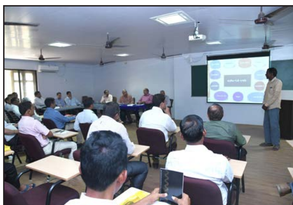
Theme 4 Session at Organic Farming Training Hall, Agronomy Farm, BACA