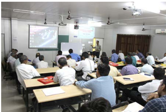
Theme 7 Session at PG Exam Hall-1, BACA