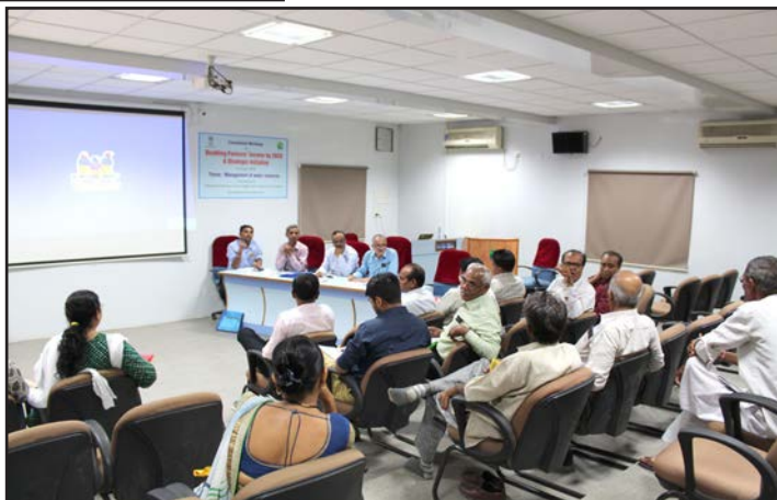
Theme 3 Session at PG Seminar Hall-2