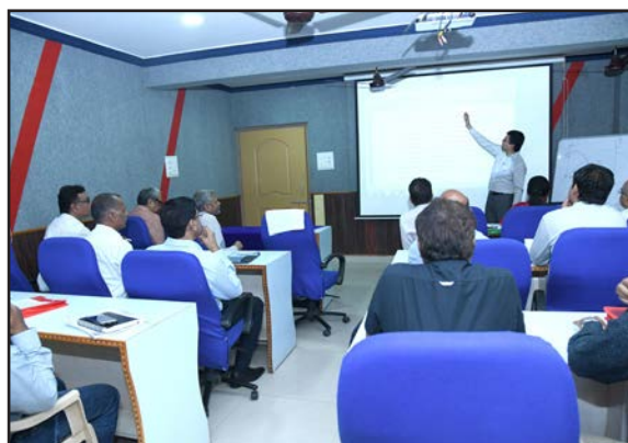
Theme 14 Session at TULSI, Department of Entomology, BACA