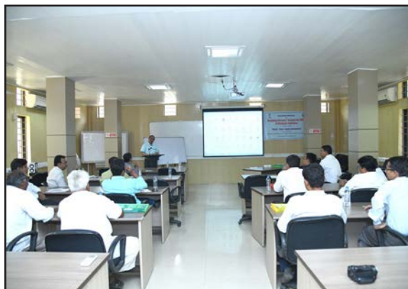
Theme 5 Session at Extension Education Institute - 2