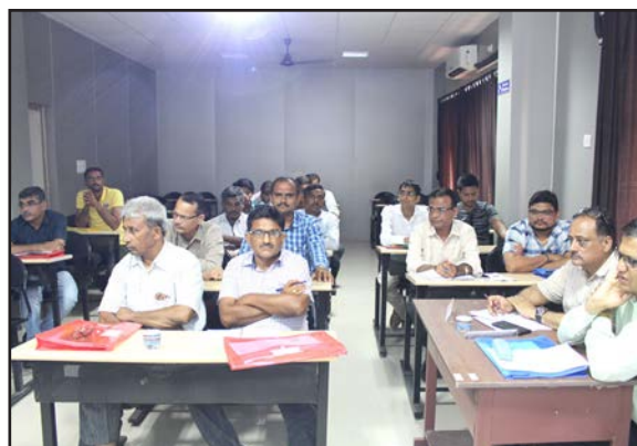
Theme 11 Session at PG Exam Hall-3