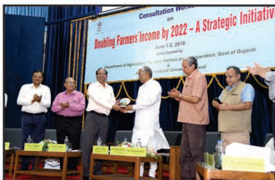
Consultation Workshop on "Doubling Farmers' Income by 2022 - a strategic initiative" held on June 1-2, 2018