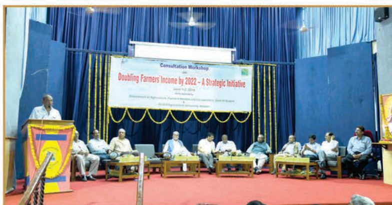
Shri Jaydrathsinhji Parmar, Hon'ble Minister of State, Agriculture (State Minister), Panchayat, Environment (Independent Charge), Government of Gujarat addressing at Inaugural session