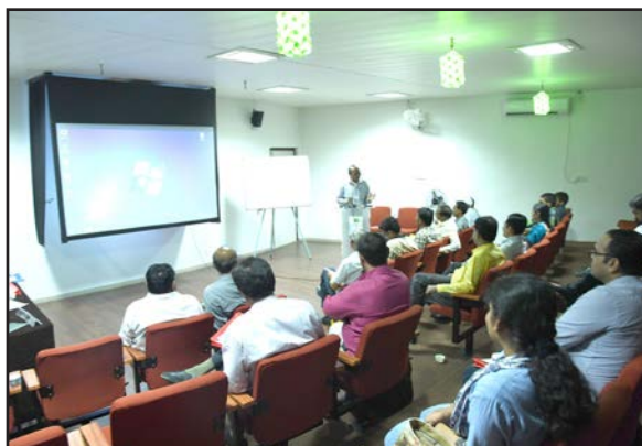
Theme 13 Session at Sardar Patel Educational Museum