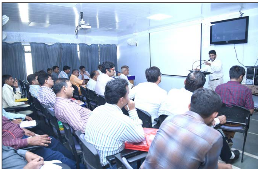
Theme 8 Session at Sardar Smruti Kendra Training Hall - 1