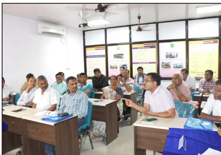
Theme 10 Session at PG Seminar Hall- 1, BACA