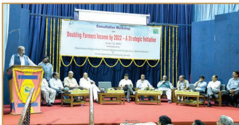
Shri Parshottam Rupala, Hon'ble Union Minister of State for Panchayati Raj, Agriculture, Farmers Welfare, Government of India addressing at Inaugural session