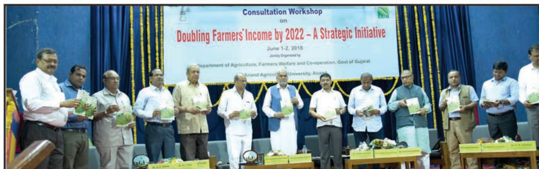
Consultation Workshop on "Doubling Farmers' Income by 2022 - a strategic initiative" held on June 1-2, 2018