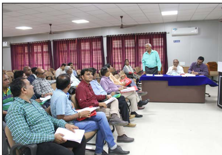
Theme 9 Session at PG Exam Hall-2